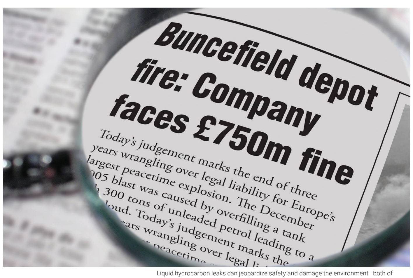
Liquid hydrocarbon leaks can jeopardize safety and damage the environment—both of which can be costly to your reputation and business.